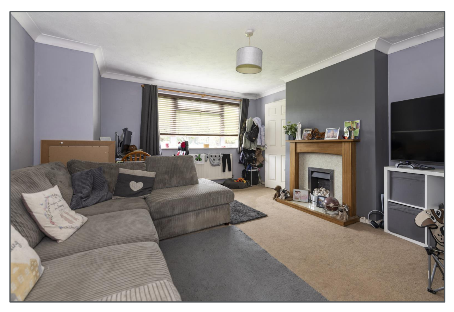
Nevill Road, Uckfield, TN22 1LJ

This two bed ground floor apartment is conveniently located for both the town centre in one direction and some wonderful woodland walks in another. Backing onto the Buxted woods, this area of the popular Manor Park development is very quiet and surrounded by fields and countryside. The apartment also comes with its own private lawned garden and an off road parking space which are very sought after features of any property at this price point. The property also has a lovely big lounge, modern kitchen and two double bedrooms so will appeal to first time buyers and investors alike. With the outside space and parking included it could even work for a small family too, so we expect this to be popular.